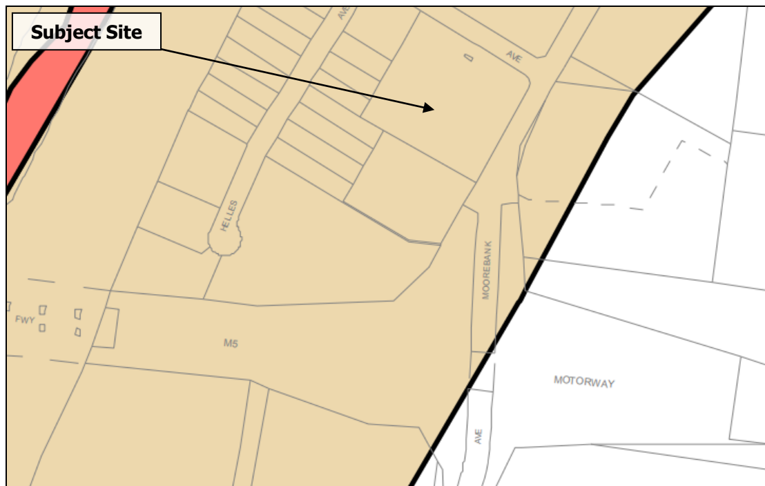
Figure 5. Acid Sulfate Soils Map (NSW Legislation, 2017)

2A and 4 Helles Avenue, Moorebank (Lot 3 and Lot 1 in DP 626253)