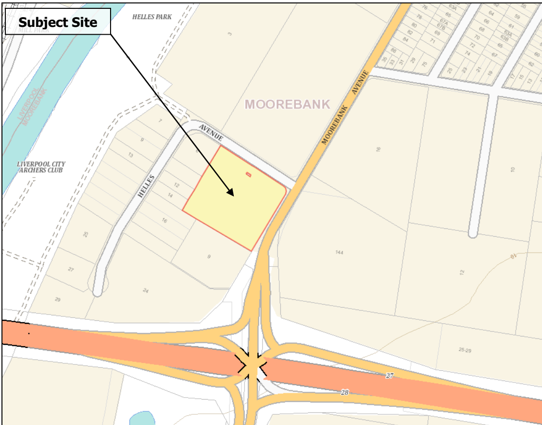
Figure 2. Cadastre Map (SIX Maps, 2017)