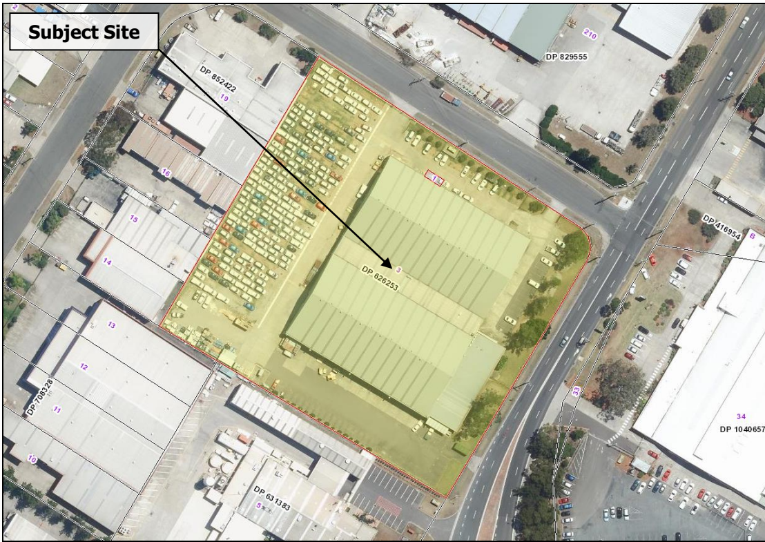
Figure 1. Existing Site Development (SIX Maps, 2017)

2A and 4 Helles Avenue, Moorebank (Lot 3 and Lot 1 in DP 626253)