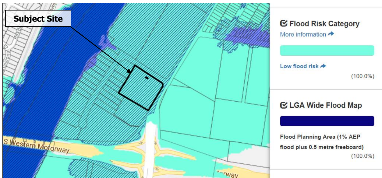
Figure 6. Flood Map (Liverpool ePlanning Portal, 2018)

2A and 4 Helles Avenue, Moorebank (Lot 3 and Lot 1 in DP 626253)